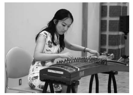
A member of the Huayi Chinese Traditional Art Union perform a traditional Chinese performing art.

Following the Special Lecture, Sylff Administrators Meeting participants attended a Welcome Reception at the APU cafeteria