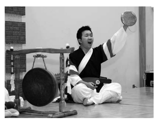
APU Samulnori Team Shinmyoung turned in a rousing performance of Korean percussion instruments.