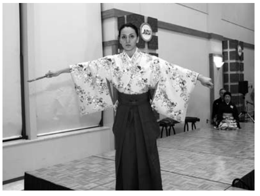
Nohgaku Circle members demonstrate a Japanese stage art going back 600 years.