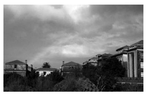
The University of the Western Cape, where the author conducted her research in South Africa.

Within the Union of South Africa, particularly following the Second South African War, however, politics between English- and Dutch-descended white South Africans created divisions and distinctions within society as they jostled to gain political control, and the country's large Jewish population often became the targets of hostilities. Manifestations of growing anti-Semitism include the