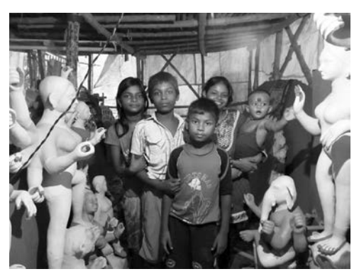
Children celebrating Durga Puja, the biggest festival of West Bengal, where the author conducted interviews for her research.

Succumbing to violence, whether as oppressor or oppressed, is the dominant pattern in most plots. The characters suffer physically through beatings, psychologically through trauma, and emotionally through frustration and anxiety. The characters' sufferings could be reflective