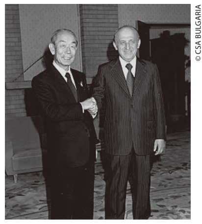
Bulgarian prime minister Todor Zhivkov and Japanese Prime Minister Takeo Fukuda, 1978, Japan.

In response to the Bulgarian state visit in 1978, the next year, in October 1979, Bulgaria was visited by Crown Prince Akihito and Crown Princess Michiko as the official representatives of Emperor Hirohito.