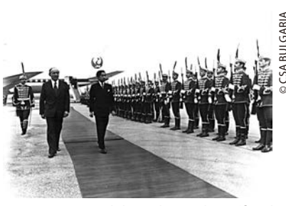
Crown Prince Akihito during his official state visit to Bulgaria, October 1979.