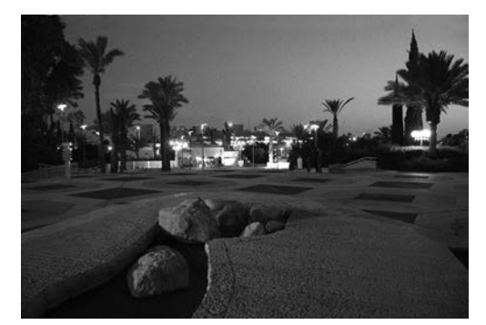
The BGU campus at dusk.

one. Academically, it required me, a student of international relations from India, to interact in a society that was foreign and unknown. Studying the history of the 1948 War was a process of understanding the birth of the state of Israel. It explained the origins of the protracted conflict between Israel and the Palestinians. In the history of modern international politics, the Israel-Palestine con-