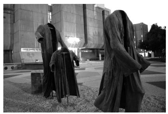
Installed art on the BGU campus titled "Three Coats and a Travel Trunk," symbolizing graduates of the university walking out into the "real world" with the knowledge accumulated during one's university years.

The conversations provided me with the knowledge of the personal journeys of the New Historians which explained the nuances of their ideological or political