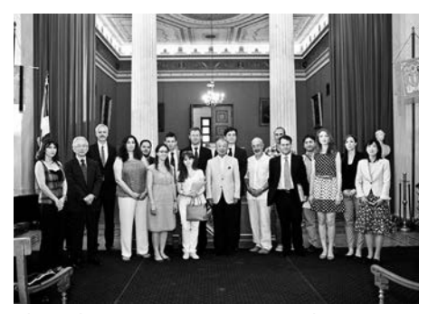
The 20th anniversary ceremony at the University of Athens .

The Sylff program at Athens has not always been smooth over the past two decades. Recently, it was adversely affected by the Lehman crisis and the national debt crisis. However, despite these difficulties, a newly constituted Sylff steering committee