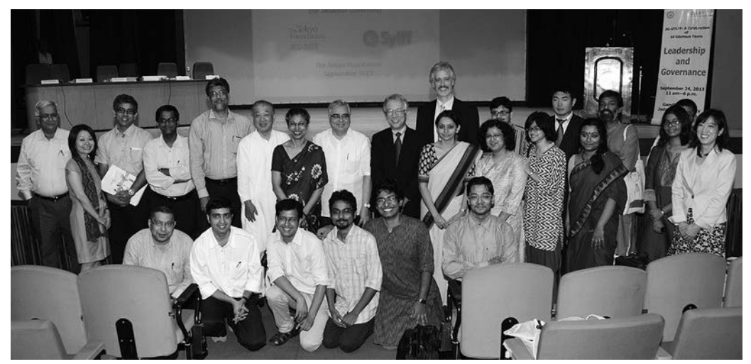
Jadavpur fellows, past and present, gathered for the ceremony.

On September 24, 2013, the university celebrated 10 successful years of the