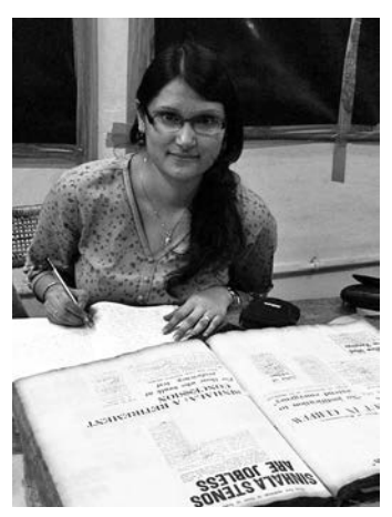
At the National Archives of Colombo.

The sole documentation of much of the parliamentary debates and official proceedings under the presidency (since 1976) in Sinhala and the conspicuous absence of their translation in English and Tamil languages at the National Archives of Colombo was, to my mind, a significant indicator of the calculated steps taken by the ruling elite to use "language hegemony" in asserting Sri Lanka as a Sinhala