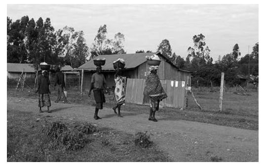
Village women walk with baskets balanced on their heads.

that Kenyans had to begin casting their votes on the basis of the candidates' policies, rather than their ethnicity, if democracy was to function properly in Kenya. And for this to happen, elected politicians had to begin rewarding their constitu-