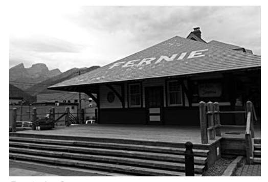
Fernie Art Depot

wage labor in a rural location with a high cost of living, which has pushed many local businesses to develop retention strategies ranging from a free ski pass to medical benefits. However, for particular positions, some businesses have gone beyond established channels of recruitment and turned to the Temporary Foreign Worker Program (TFWP) to meet their labor needs.