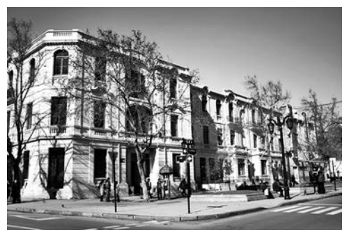
Andrés Bello National University

My research at Chilean universities revealed that some academic departments and professional schools were highly dependent on their part-time professors. Although their employment was not secured, part-time professors at these universities were offered very good salaries and incentives for their teaching ser-