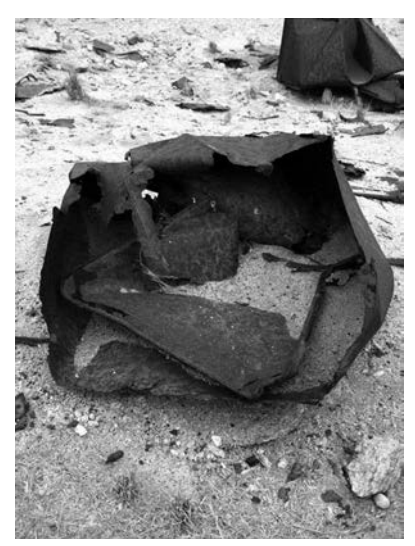
South African troop debris in the Namib Desert from World War II.

A government reply to the first letter mentions "anti-Jewish activities" during "the past two years" and assures SAJDB that it is monitoring the situation. It did not, however, provide further context for the situation.<sup>4</sup> These gaps can be filled in using family papers, interviews, and memoirs. These deeply personal documents chronicle the micro-aggressions that South Africa's Jews experienced during this period, and several place the incidents—such as boycott campaigns and efforts at spreading libel against Jewish community leaders—within the larger context of