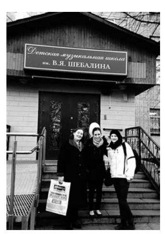
With Shebalin's great-granddaughter and great-great-granddaughter, outside the Shebalin Music School in Moscow.

Through the research conducted with the SRA grant, I was able to construct a complete picture of Shebalin and his compositional output. The future implications of this research are twofold. First, and perhaps most importantly, it would provide hope for stroke victims that in spite of the odds, Shebalin was able to continue to create music and express himself