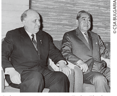
Bulgarian prime minister Todor Zhivkov and Japanese Prime Minister Eisaku Sato, 1970, Japan.

In the 1960s the first joint ventures between Bulgaria and Japan were established. In 1967 the Bulgarian state company Balkancar and the Jap-