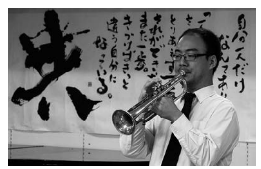
The Ishinomaki concert.

It was a very hectic week, and I was quite tired by the time we reached Suntory Hall, but I thoroughly enjoyed all the rehearsals and the concert itself.