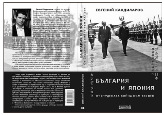
The book Bulgaria and Japan: From the Cold War to the Twenty-first Century is almost entirely based on unpublished documents from the diplomatic archives at the Bulgarian Ministry of Foreign Affairs. In order to clarify concrete political decisions, many documents from the Political Bureau of the Central Committee of the Bulgarian Communist Party, Comecon, and State Committee for Culture were used. These documents are available at the Central State Archives (CSA) of the Republic of Bulgaria. For additional information, memoirs of eminent Bulgarian political figures and diplomats who took part in the researched events were also used.

The inner boundaries of the study are defined by two mutually related principles. The first is the spirit of international relations that directly influenced the specifics of the bilateral relationship, and the second is the domestic economic development of Bulgaria, a country that played an active role in the dynamics of the relationship. In this way, the 1960s, 1970s, 1980s, 1990s (through 2007, when Bulgaria joined the EU), and the years since 2007 represent five distinct stages in