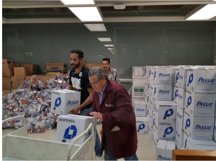
Help delivered on February 10 th , 2018