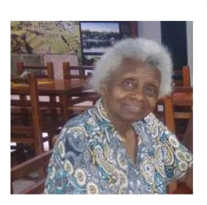
Illustration - Exu - Zul+